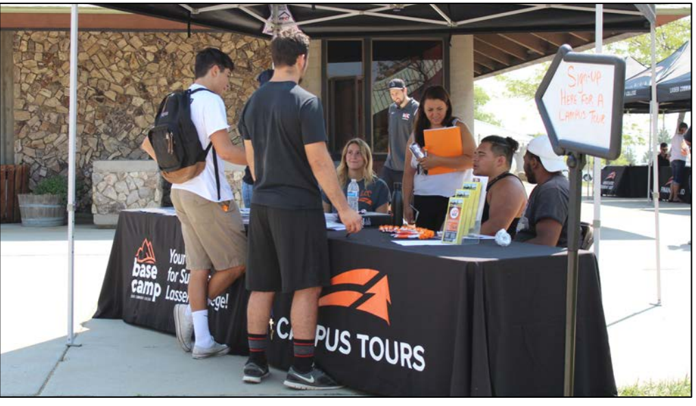
One of the many offerings at the inaugural Lassenfest Resource Fair was the option for new students and their family and friends to receive campus tours by current students.

Students enjoyed a free daily lunch before the start of each session that allowed them the opportunity to meet and network with other students. The CSB drew a large daily audience and concluded with a drawing for a laptop.