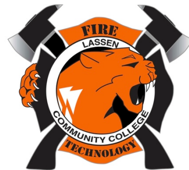
Fire Technology (approved 2013)

In addition to the LCC logos, LCC's various departments also possess a list of identities. These identities or program logos may evolve, change, or diminish over time, and additional logos may be created for new programs. Currently, the Athletic Department's mascot represents the power and strength of the cougar. The Fire Technology logo has taken on the aggressiveness of the Athletic Department's cougar mascot and arranged it with the hand tools of firefighting. Automotive Technology Department uses the tools of the trade with electrical component to identify their program. Any club or entity of LCC must have their logo approved by the Dean of their program prior to use. Student clubs and ASB must have logos approved by the Dean of Student Services.