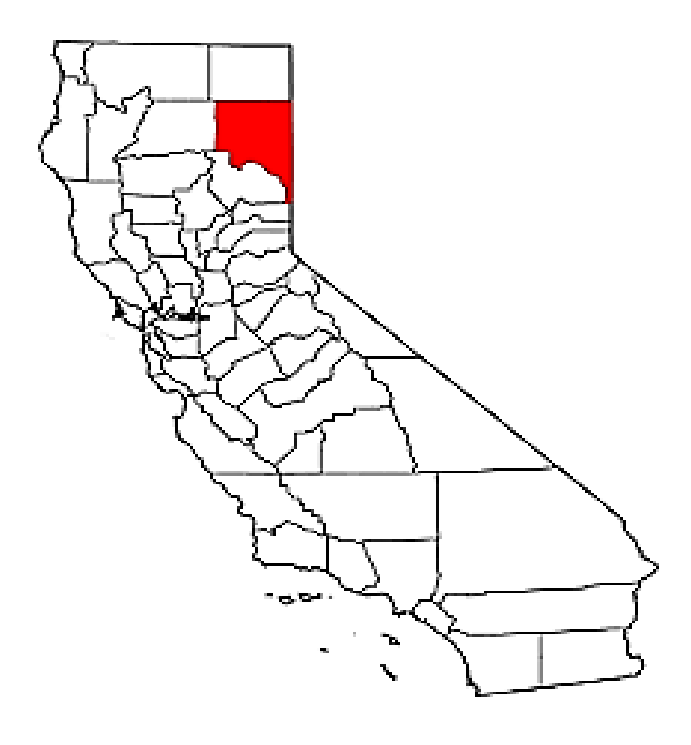
Map of Modoc County in California